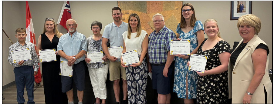
Council recognized 9 community members with Ontario Volunteer Service Awards in 2025.