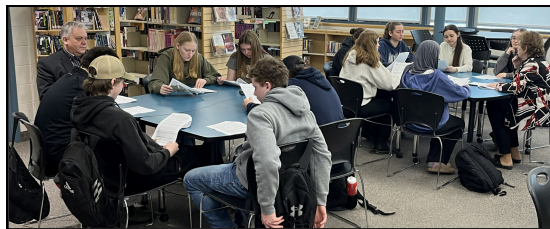
Council at Wellington Heights Secondary School on March 10, 2026.

Hybrid Council meetings improving access and transparency