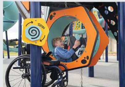
NICHE CAPSULE NANO™