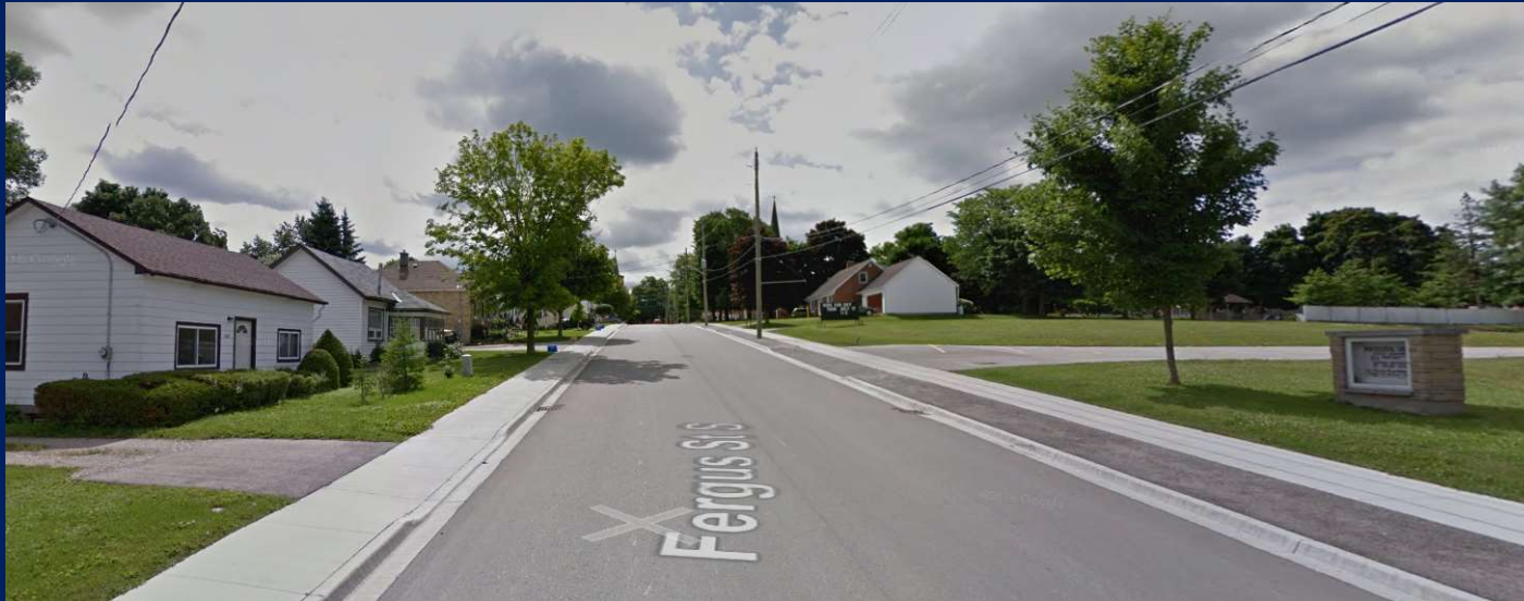
Pic 1 Fergus Street South between Queen Street East and King Street East