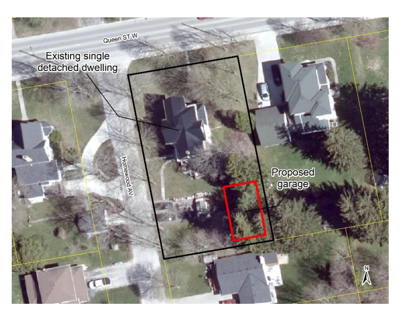
Figure 1. 2020 Aerial photo of subject lands

The purpose of this application is to provide relief from maximum height for an accessory structure. The applicant is proposing to construct a new garage for personal use which will include a second floor for a future additional dwelling unit. The garage is proposed to have a maximum height of 8.5 m (28 ft).