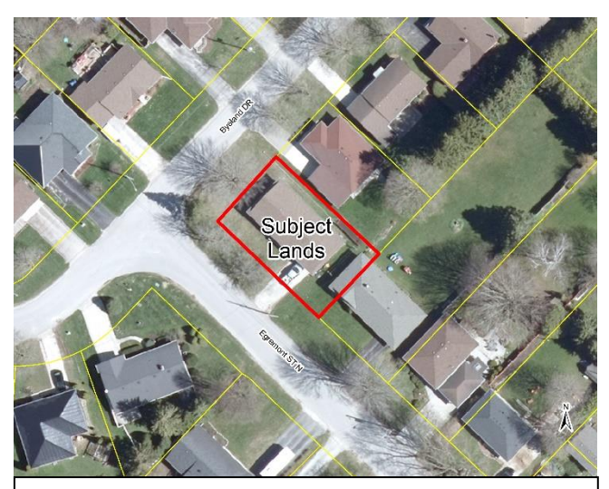
Figure 1. 2020 Aerial photo of subject lands

The purpose of this application is to provide relief from the minimum width for a private garage. The applicants are proposing to add an additional residential unit in the basement. As a result, an additional permanent parking space is required. The applicant is proposing to make