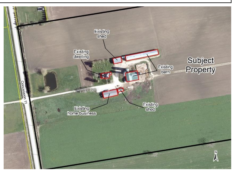
Figure 1: 20202 Aerial photo

The purpose of this application is to provide relief from the maximum floor area