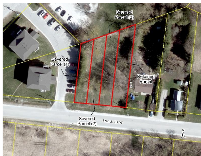
Figure 1. 2020 Aerial photo

The purpose of this application is to provide relief from the minimum lot frontage requirements for two proposed semi-detached dwellings. This variance is associated with consent applications B93/21, B94/21 and B95/21, that was granted provisional approval by the Wellington County Land Division Committee.