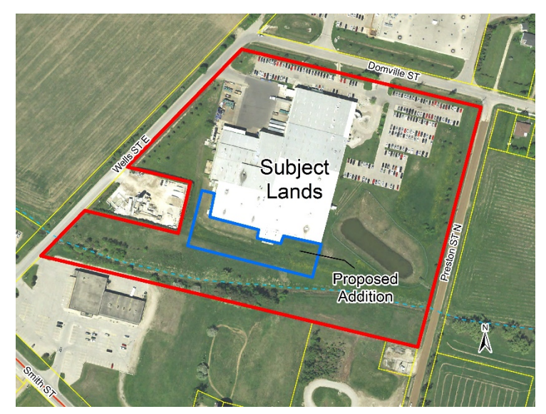
Figure 1 Page 1 of 2

The location of the subject property is described as Part Park Lots 5 & 6, S/S Domville St being Arthur Crown Survey, Part 1, Plan 60R-3036, and Parts 1 & 2, Plan 60R-1199 except Part 1 Plan 61R-6456, geographic Township of Arthur, with a civic address of 333 Domville Street, Arthur. The subject land is approximately 7.74 ha (19.14 ac). The location of the property is shown on Figure 1.