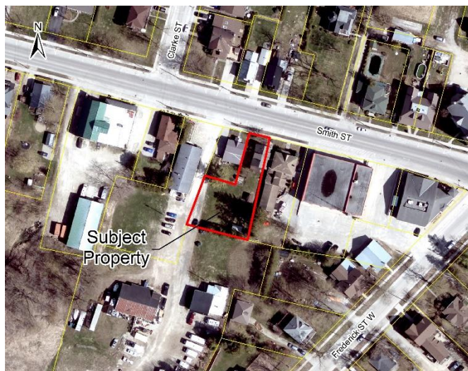
Figure 1. 2020 Aerial photo of subject lands

The purpose of this application is to recognize an existing residential use in a commercial zone and permit two additional residential units in a single